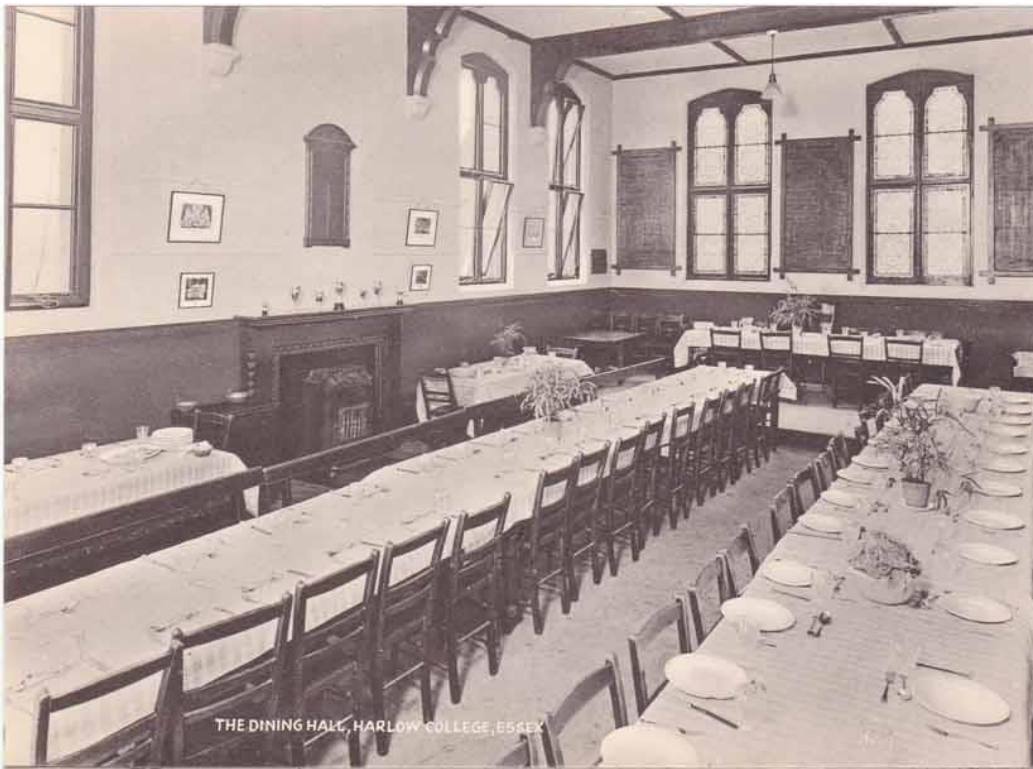
THE DINING HALL, HARLOW COLLEGE, ESSEX