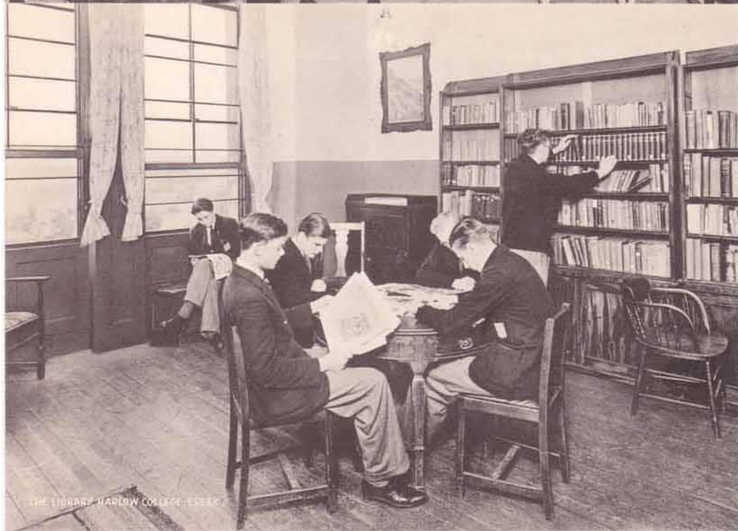
THE LIBRARIAN, HARLOW COLLEGE, ESSEX