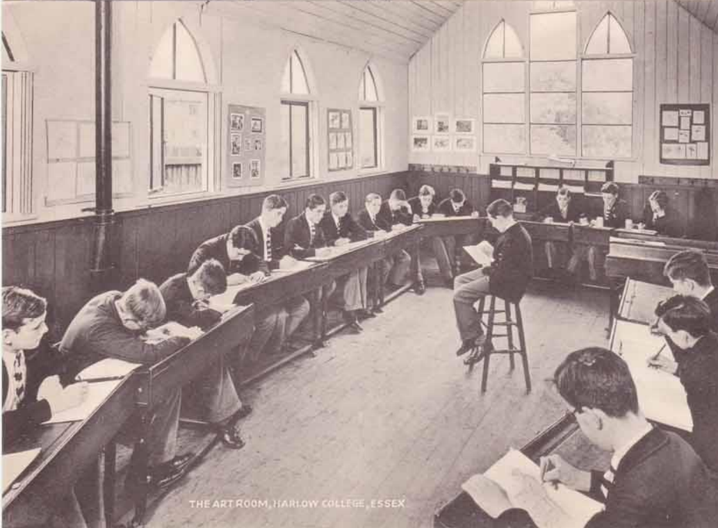
THE ART ROOM, HARLOW COLLEGE, ESSEX