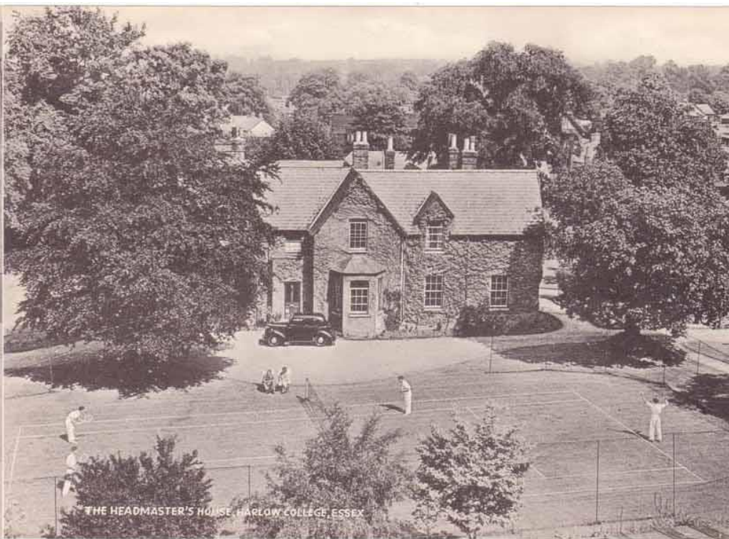
THE HEADMASTER'S HOUSE, HARLOW COLLEGE, ESSEX