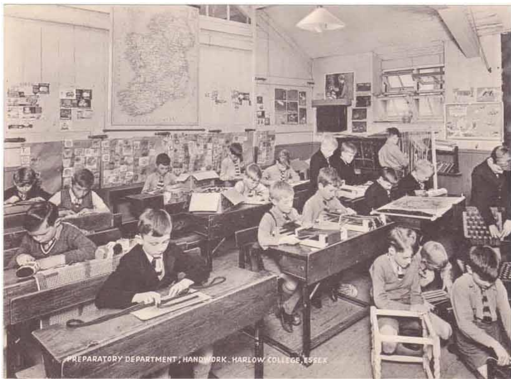
PREPARATORY DEPARTMENT, HANDWORK, HARLOW COLLEGE, ESSEX