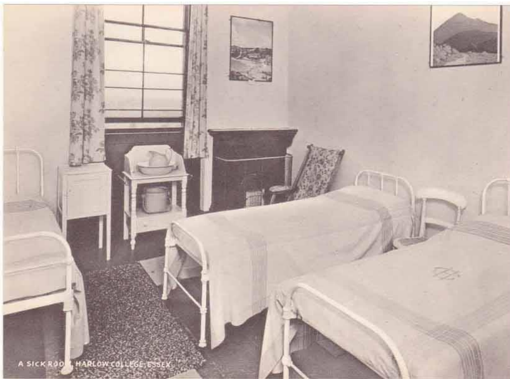
A SICK ROOM, HARLOW COLLEGE, ESSEX