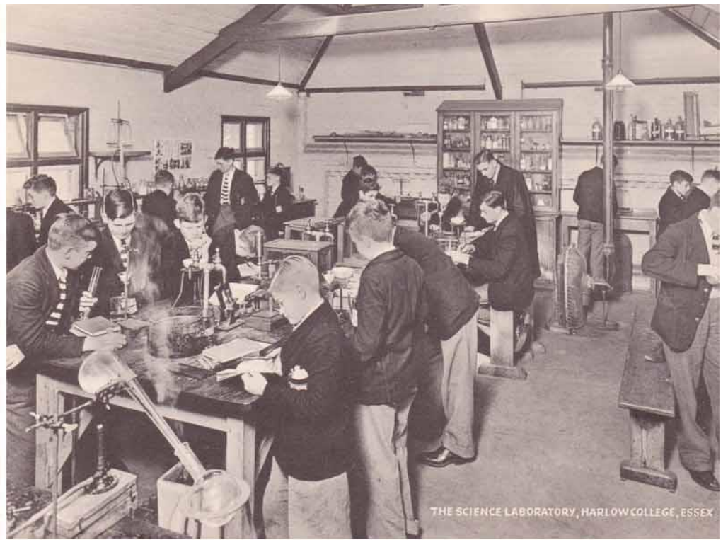
THE SCIENCE LABORATORY, HARLOW COLLEGE, ESSEX