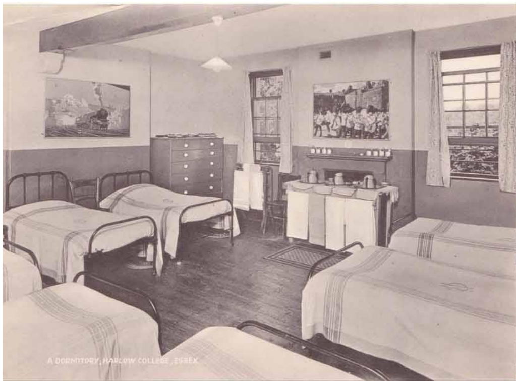
A DORMITORY, HARLOW COLLEGE, ESSEX