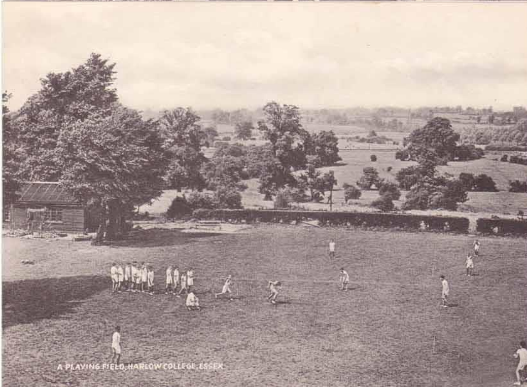
A PLAYING FIELD, HARLOW COLLEGE, ESSEX