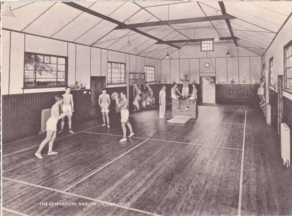
THE GYMNASIUM, HARLOW COLLEGE, ESSEX