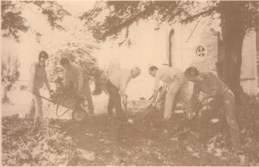
Volunteers at work in the Churchyard.