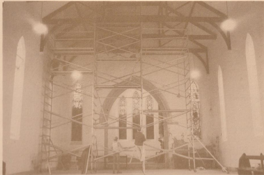
Members of Harlow's Task Force tackle the ceiling.